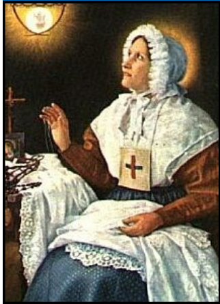
Bd. Anna Maria Taigi Pray for us!

June 3: St. Charles Lwanga and companions (1886+) were pages at the court of King Mwanga who refused to give the king the sexual favors he demanded. Charles became the head catechist and baptized the younger of the pages at night before the 22 Catholics and 24 Protestants were marched 16 miles to the place of execution on Lake Victoria in Uganda.