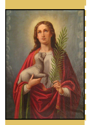
St. Agnes Pray for us!