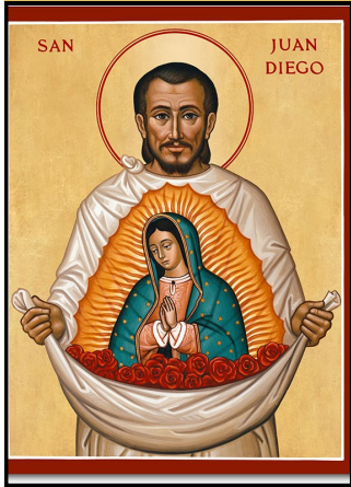
St. Juan Diego, Pray for us!