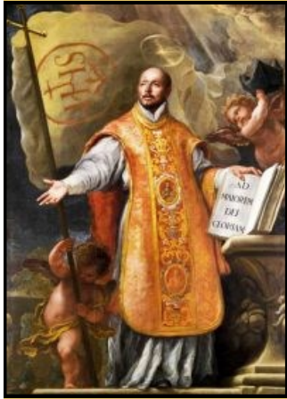
St. Ignatius of Loyola, Pray for us!

July 29: St. Martha, Mary and Lazarus (first century). Practical minded Martha! Concerned that her sister Mary is not helping her with the details of hospitality! Concerned that there will be a smell since it is the fourth day since her brother Lazarus' burial! How she is loved by the townsfolk of Tarascon in Provence -- where the principal church is named for "Ste. Marthe" and her (supposed) relics are venerated.