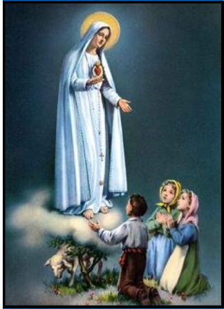
Our Lady of Fatima Pray for us!

May 13th: St. Andre Fournet (1752-1834) gives hope to all parents whose precious children say, “religion is boring”. Andre was idle and frivolous and ran away from home to pursue a life of pleasure. And he had bad handwriting! He was ordained in 1776 with the encouragement of a devout diocesan priest and uncle. He weathered the French revolution and became a spiritual director for St Elizabeth Bichier des Ages. St. Servais de Tongres (384) is an early Belgian Bishop whose letters of support for St. Athansius of Egypt gave him such hope in times of persecution. Though tricked into supporting some confusing heretical theological statements later on, St. Servais was enlightened by his other friend, St. Hilary of Poitiers into clear Catholic faith.