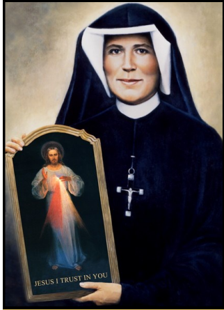
St. Faustina Kowalska, Pray for us!