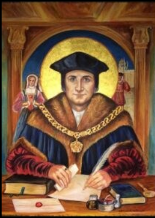
St. Thomas More Pray for us!

June 17: St. Rainerius of Pisa (1117-1161) is the principal patron saint of Pisa! Forget the leaning tower – study the frescoes depicting his life at the Campo Santo, and then venerate his relics in the cathedral. He went from penitential merchant to pilgrim mendicant from Pisa to Mt. Tabor.