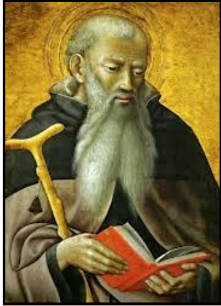
St. Ammon, Pray for us!