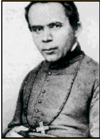
St. John Neumann, Pray for us!

Dec 30: Bd. Margherita Colonna (1280). Her relics are at St. Cecilia's in Trastevere; I hope to pray there someday. She was such a holy Franciscan nun who worked so many miracles while she suffered 7 years with cancer.