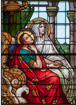
St. Monica, Pray for us!