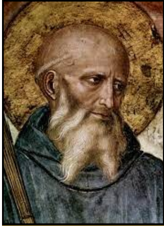
St. Benedict of Nursia Pray for us!

July 8: SS. Kilian and Companions (689) came from Mullagh – near the Cavan/Meath border (where the Reilly side of my family hails) and would evangelize and become martyrs in Würzburg. Their three heads were enshrined in the cathedral. Like John the Baptist – Kilian was killed for telling the local neophyte chief that his marriage was against God’s law.