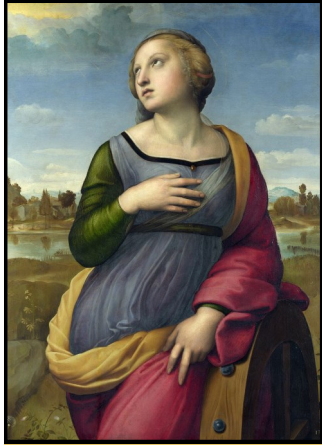
St. Catherine of Alexandria, Pray for us!

November 25: St. Catherine of Alexandria (early fourth century). Known as Great Martyr Catherine of the Wheel, she is the Egyptian patron saint of woman philosophers – taken off the calendar by St. Paul VI, and put back by St. JP II!