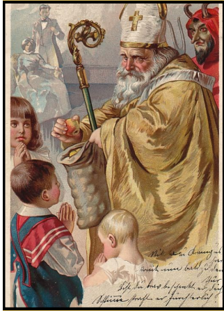
St. Nicholas, Pray for us!

December 2: Bd. Jan van Ruysbroeck (1293-1381). Rhineland mystic whose books in the Brabant-Flemish dialect are extraordinary. He would spend hours in the forest where no human distraction came between his ear and the voice of God.